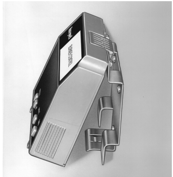
Fig. 2. Mounting the Keyboard Display Module on the Remote Mounting Bracket.